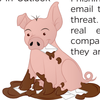
Spammy the Spam Pig

Phishing is a specific type of spam email that poses a more unique threat. Phishing emails look like real emails from trustworthy companies or organizations, but they are actually clever attempts to get your personal information. They will often ask you to click on a link or reply to the email.